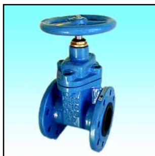
SERIES 500 and 504